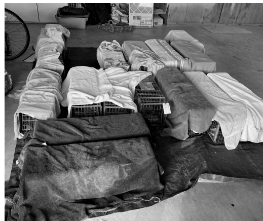
Trapped cats wait in garage overnight before morning surgery.

I recently talked with the owners of the industrial complex and they have agreed to set up a feeding station and let the cats remain on the premises. We have someone who is feeding them temporarily, but we need to find a person or persons who will feed them on a permanent basis. Please contact me at (805)458-3978 if you would like to volunteer.