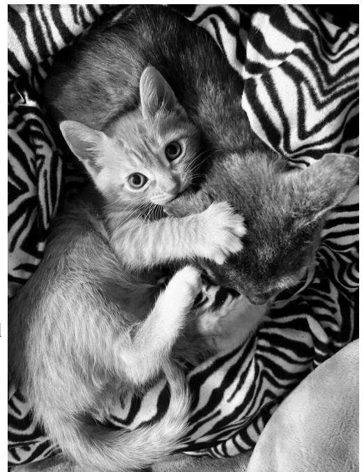
"This is my love grip."