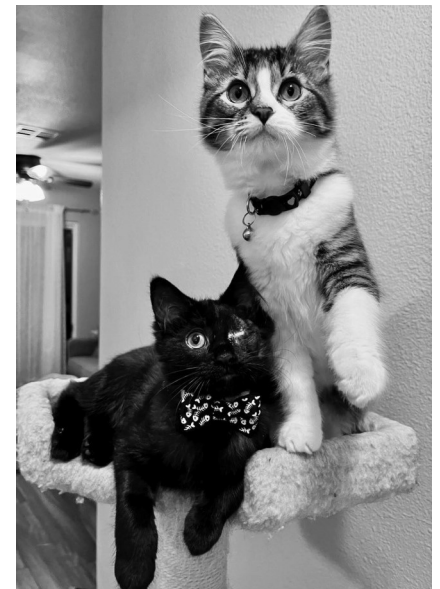
Sneakers before surgery for his left eye, and buddy Pirate

Sneakers met his best buddy and playmate Pirate while in foster care. They are inseparable and have been adopted together into their forever home. "This little guy is worth every tear I cried and plenty of sleepless nights! He is a special little guy. I would do it again in a heartbeat."