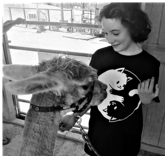
Alpaca petting with a cat t-shirt.

other older feral kitten, Waffles, who had just been placed on the ranch a month earlier. To everyone's delight, Sawyer and Waffles bonded immediately and now mouse the hay barn at