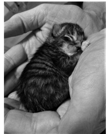
'I'm just two days old.'