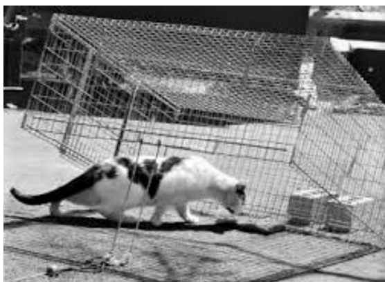
"Yum, yum, looks safe to me."

man who took care of the cats had passed away. The man's family worked with me to rescue five tame cats that were inside the business, including a mama cat with three four-week-old kittens. When I was trying to pick up the kittens with my hands,