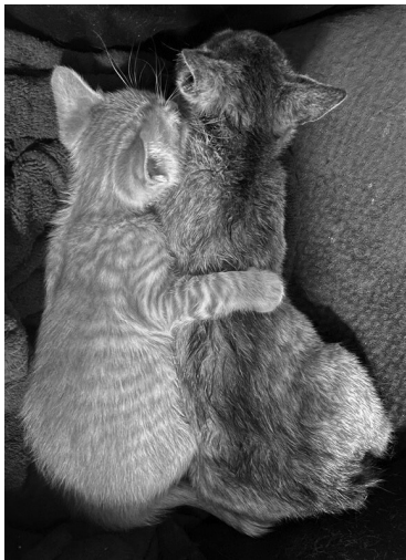
"Everything will be all right," whispers Cricket into Catya's ear.