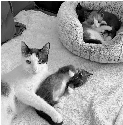
"Don't mess with my babies," says the protective mom.

man who took care of the cats had passed away. The man's family worked with me to rescue five tame cats that were inside the business, including a mama cat with three four-week-old kittens. When I was trying to pick up the kittens with my hands,