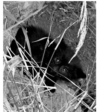
"I was alone in a field."