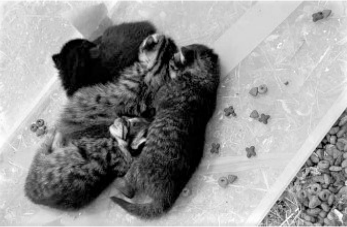
"We were stranded on a country road."