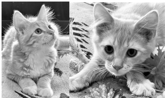
Ollie and Murphy, bonded brothers.

If you or someone you know is considering adopting, now is a great time! We are overflowing with kittens! Adoptions have been very slow and new babies keep coming in. Adorable kittens approaching their teenage years that did not get adopted when they were younger are frequently passed over as adopters tend to choose very young kittens. Please help us find homes for our older kittens!