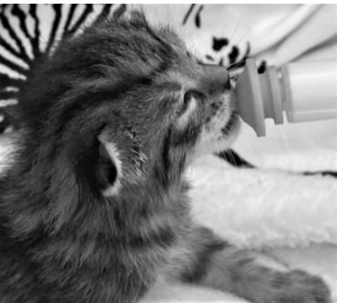
"I was really thirsty."

following day, however, she did find another two-week-old kitten, alone and covered with burrs, quite some distance from where the bin was left. The kitten could not have gotten there on its own, or survived a night alone, so we assume the mama cat must have carried it. Traps were set in hopes of reuniting the mama with her offspring, but to no avail. It is heartbreaking to think of this frightened mama cat, alone in unfamiliar territory and unable to care for her babies.