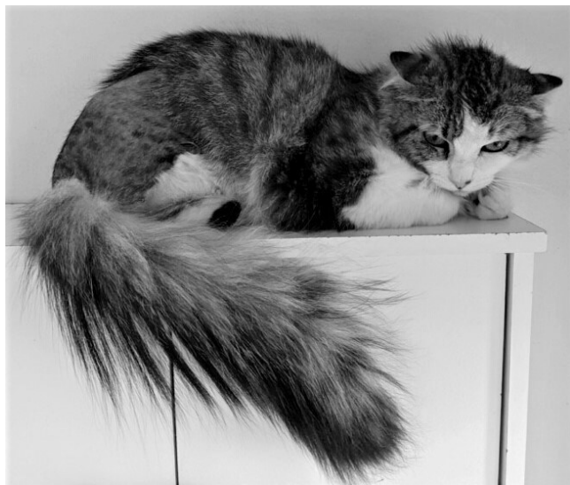
Trike recuperates comfortably in her new home.