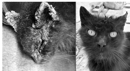
Elijah's Amazing Recovery

We rescued many large litters during spring and summer, some with seven or more kittens, and large litters have continued to come in throughout the fall. Many of the kittens have had medical issues, including neurological disorders, as well as digestive and upper respiratory conditions that are difficult and time-consuming to treat. We have also rescued kittens with eye and skin conditions that required treatment. We have a kitten with cataracts in both eyes who may lose his sight or require surgery in the future. "Fox," a kitten that had to have an eye surgically removed, was rescued with three littermates, and they were all so malnourished they were very near death. Two of the kittens were treated for maggot-infested wounds. We recently took in "Elijah Cummings," a super sweet seven-year-old cat with a severe case of mange. After just 10 days of treatment, Elijah made an almost miraculous recovery!