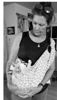
Olive in a Sling