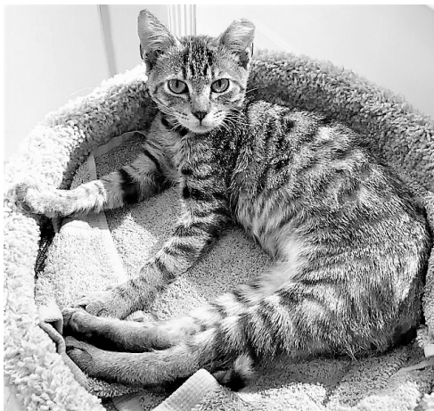
“Mahalo (thank you) for my life.”

I traveled again to Hawaii in September, this time to the Island of Kauai, with the nonprofit Animal Balance on another cat spay/neuter campaign. While performing high-volume surgeries one day, a very small, thin kitten was spayed. After surgery her heart stopped beating and she quit breathing. A veterinarian quickly gave her an injection to reverse the effects of the anesthesia. CPR was performed and she was given oxygen. Amazingly, after three minutes her heartbeat returned and she started breathing again! Unfortunately, the trauma of her near death and resuscitation caused her to lose her sight. The vets felt she would regain some of her sight but probably not all. We named her Anu, which means “cool cat” in Hawaiian.