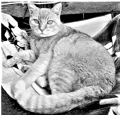
"I must have nine lives!"

"Buddy" is an orange tabby that I would see around my apartment complex. I wasn't sure if he was feral because he kept to himself. When it was chilly, he would climb in the back of a neighbor's convertible (the top was ripped). Fast forward to a cold and rainy day in January 2017, when I came home to see Buddy huddled down under my patio. He greeted me with a very sad sound, "muuuoww." That day, I started to feed him and provided a cat bed for him to curl up in. He began to follow me to the laundry and to neighbors' homes when I visited. He would beg to come in my apartment but my other cat wouldn't accept him.